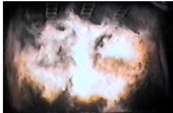
Figure 4 Pre IFGR Operation

To date, ETEC has been responsible for ~80% of all IFGR system installations on electric utility boilers in the country.